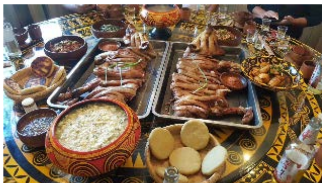
(彝族大餐展示-A illustration of the famous "Feast of Yi" )