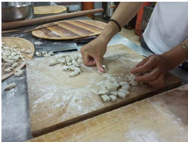
(猫耳朵 - Maoerdu pasta)

Shanxi is famous for its noodle culture. Shanxi people developed near 300 kinds of noodles which means that you can have different noodles for every meal for three months, with a rich variety of shapes and flavours. Some examples include sipping noodles, hele, bolanzi, kaolaolao, noodles with sauce, braised noodles, wantuo and dipping slices.