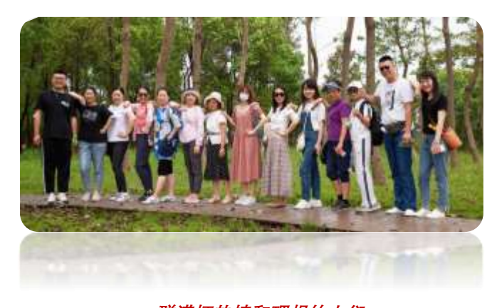
一群满怀热情和理想的人们 People with Passion and Dreams

Supporting the project from behind the scenes is a hard-working and passionate team. They can be demanding teachers, a big sister confidente, and also a professional role-model. Today we take a closer look at them in a personal setting. On the 25th of August, on a glorious day, our team made a visit to Chongming Island for team building. All those young and young at heart had great fun!